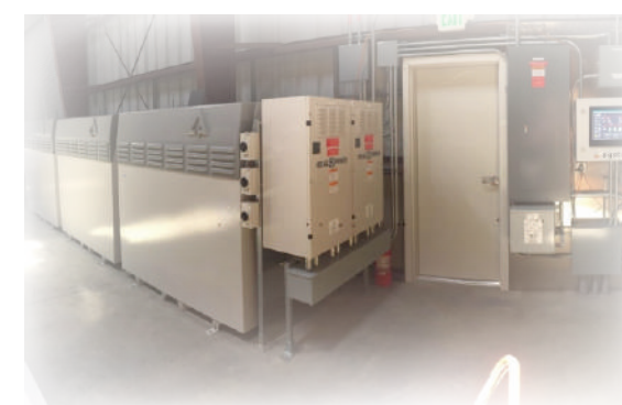
Power Backup for Common Area Lighting & Lift